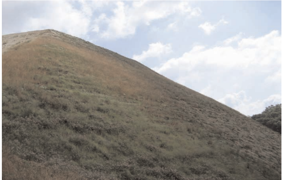
Miramesh® GR on slope face.

Extension of Runway 5 at Yeager Airport in Charleston, WV would have been extremely costly without a geosynthetic reinforcement solution. The RSS allowed for an economical solution and less complicated construction than the other, traditional methods that were considered. The reinforced slope was successfully completed and is performing as expected. Miragrid® XT geogrids provided the high strengths required for a structure of this size and Miramesh® GR allowed for facing stability and quick germination of surficial vegetation for improved stability. The structure allowed the airport to meet recent FAA Safety Standards while creating an engineered structure that blends into the scenic green hills of Charleston, WV.