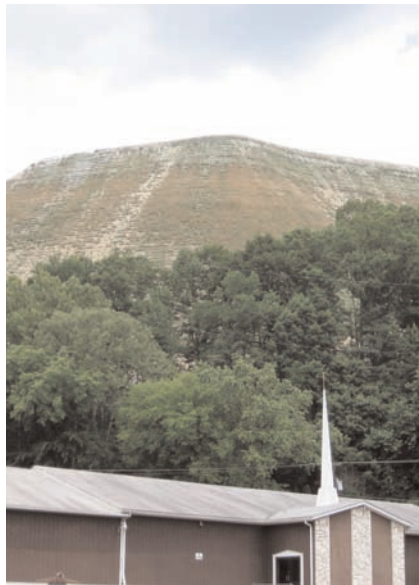
Slope shortly after completion with early vegetation growth.