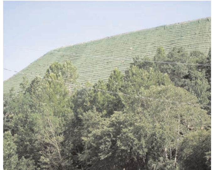
Slope face during construction, approximately 80% complete.