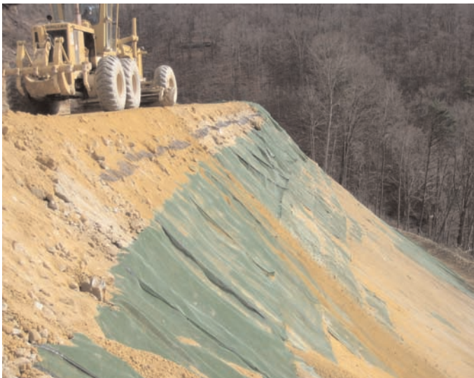
Early construction at the bottom of the slope.

were installed in conjunction with the backfill material. The Miragrid® XT geogrids were installed as horizontal reinforcing elements into the slope. Embedment lengths of the Miragrid® 20XT were on the order of 195 feet in length. Mirafi® G200N drainage composite was installed along the back of the excavation to intercept and drain seepage water from the existing mountain side away from the reinforced mass. Miramesh® GR was installed on the face of the slope at 2 foot vertical intervals, with 3 foot embedded into the slope face and 2.5 feet down the face for facial stability and erosion protection. Miramesh® GR is an open mesh biaxial geosynthetic specifically designed as a face wrap material for RSS and MSEV applications.