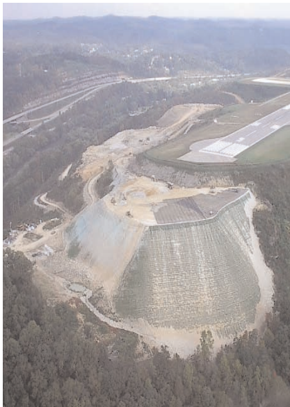
Aerial photo of slope during construction, approximately 80% complete.